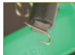
One hook can be removed with the small magnet on the end of the 'selector stick'.