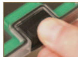
A secure, push lock mechanism stops the box from opening in transit.