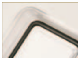
An integrated rubber seal protects the contents of the box from moisture ingress.