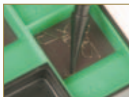
A tapered point at one end of the stick allows a single hook to be separated.

A compact storage system designed to keep hooks organised and easily accessible. The magnetic base prevent hooks from blunting in transit and a rubber seal prevents moisture ingress. Each box comes complete with a selector stick allowing a single hook to be removed quickly. Available in three sizes and five different colours, which may vary.