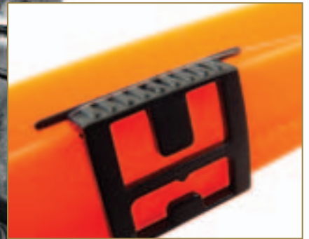
Sliding line retainer.