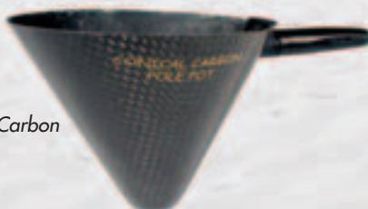
Conical Carbon Pole Pot