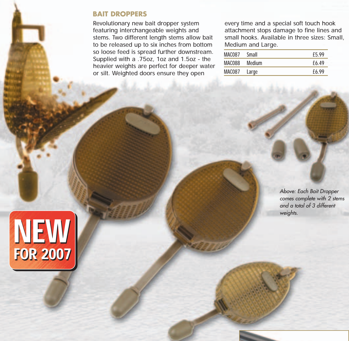
Above: Each Bait Dropper comes complete with 2 stems and a total of 3 different weights.